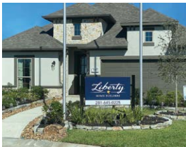
Liberty Home Builders